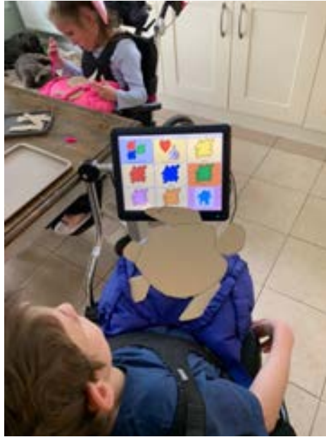
Frankie and Archie are both concentrating very hard on their activities.